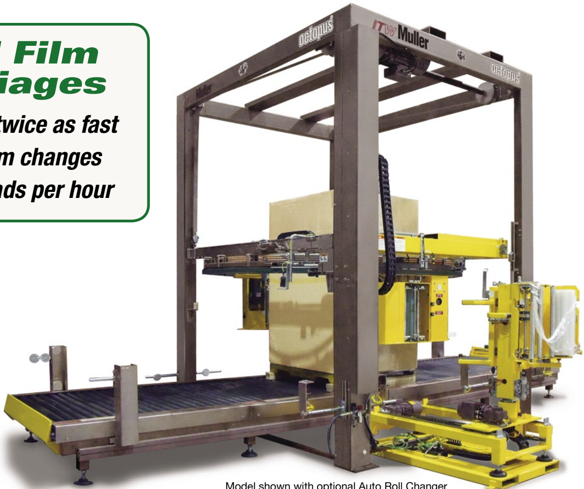
Model shown with optional Auto Roll Changer