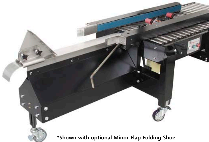
*Shown with optional Minor Flap Folding Shoe

Champion SD720-2-BF is a uniform semi automatic side belt drive case sealer used for closing and sealing the bottom only flaps of regular slotted cases, this machine provides a self contained work cell for batch or continues case set-up operations. Features include high torque gear motors, extended side belt drives, one heavy duty performance proven tape head, precise lead screw adjustment, roller bed conveyor, powder coated finish and welded modular construction. Machine adjustment and electrical controls facilitate right or left hand operation, the operating height is adjustable from 18" to 26" add 6" inches to height when using casters, one bottom 2" tape head is standard.