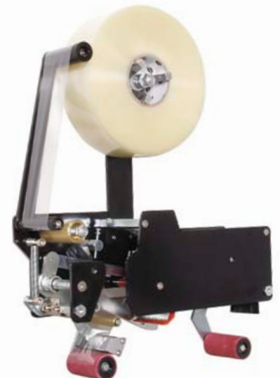
Champion Lock 'N' Load 503-3x3 MI