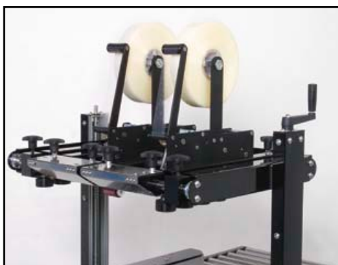
Gap taping - Double tape heads for applying 2 strips of tape to gapped cases