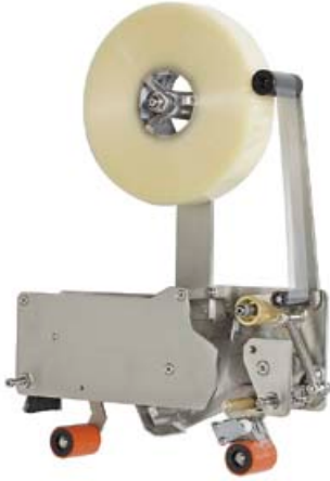
Optional Stainless tape heads: CHD 502-2-SS

Champion SD720-20-2-SS is an extremely versatile, operator friendly side belt drive uniform semi automatic case sealer, manufactured in T-304 stainless steel. This case sealer is ideal for pharmaceutical manufactures, health care products and for applications where machine wash down is not a requirement, dairy and cheese plants, meat and poultry processing are application examples. Features include high torque gear motors, heavy duty performance proven tape heads, precise lead screw adjustments, modular top housing for specialty and offset taping, roller bed conveyor and welded modular construction. Machine set-up adjustments and electrical controls facilitate left or right hand operation, the conveyor bed height is adjustable from 18" to 26" add 6" inches to height when using casters, 2 inch tape heads are standard, 3 inch tape heads are optional (Model No. SD720-20-3-SS).