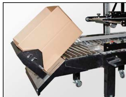
Inclined pack table - Adjustable ergonomic pack table simplifies case packing