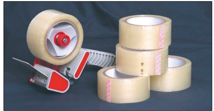
Colored polypro tapes available on request.