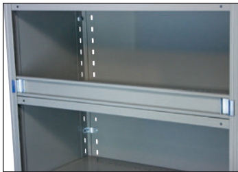
RN307 Bin Front