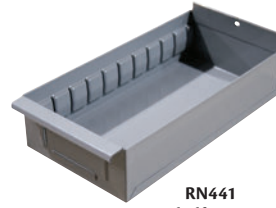
RN441 Shelf Boxes