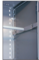
RN464 48" Hanger Bar