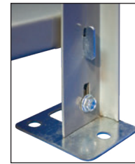
FM036 Foot Plate